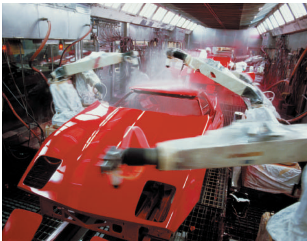
Net paint: chemical suppliers' advice has reduced car factory emissions.

The CSP's survey, scheduled for publication on 14 September, says that the practice is booming: the market for chemical-manage-